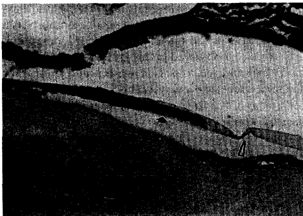
Figure 3. Second experimental group: Multilayered epithelial group (filled arrow) are attached to acellular areas (hollow arrow) in the superficial epithelium. (Hemotoxylin and eosin, original magnification \times 200 .)

Microwaves most commonly cause anterior and/or posterior subcapsular lenticular opacities in experimental animals, as described in epidemiological