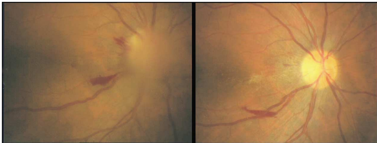
Figure 2. Left: Papillitis with peripapillary hemorrhage and prepapillary vitreous opacity are observed in right fundus. Retina is edematous in papillomacular area. Right: Right fundus 3 weeks later than shown at left. Prepapillary vitreous opacity has disappeared and papillitis has resolved.

In an acute attack of Behçet's disease, polymorphic leukocytes infiltrate the ocular tissue. The inflammation is usually transient and self-limited. In our case, the papillitis quickly resolved with absorption of prepapillary vitreous opacity and no significant tissue damage. The sudden decreased vision with central scotoma and the papillitis resolved. This reversibility suggests that the papillitis resulted from polymorphic leukocytic infiltration. The prepapillary vitreous opacity appeared to reflect an accumulation of polymorphic leukocytes that migrated from the optic disc. The prepapillary vitreous has a potential space, ie, the enlarged end of Cloquet's canal, 6 in which leukocytes may settle. To treat the papillitis, we prescribed subconjunctival steroid for only 2 days and increased the colchicine dose. It was hard to de-