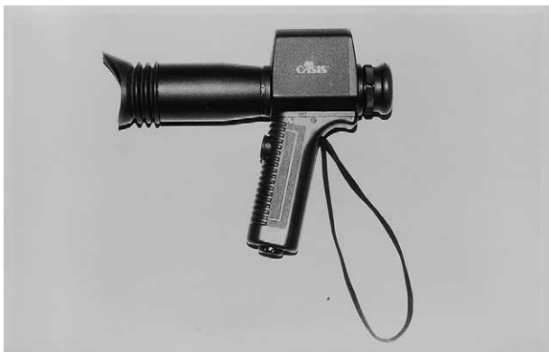
Figure 1. Colvard pupillometer.

There were no statistically significant differences in age between the emmetropic and myopic groups ( P = .054 ). Each group also had no statistically significant differences in the scotopic pupil diameter between the right and left eyes ( P = .739 and P =