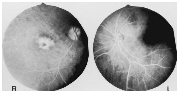
Figure 1. Fluorescein angiography shows hyperfluorescence in the macula in the right fundus and no leakage of dye in the left fundus of 73-year-old woman with bilateral pseudophakia and glaucoma after treatment bilaterally with topical latanoprost.

Topical latanoprost was replaced by unoprostone in both eyes. Topical 0.5% dorzolamide, three times daily, was added to the other two drugs for both eyes. Topical 0.1% betamethasone disodium and 0.1% diclofenac sodium, three times daily, were prescribed for the right eye for 1 month. In mid-August, her visual acuity was 1.0 OU, and intraocular pressure was 14–18 mm Hg OU. The cystoid macular edema had