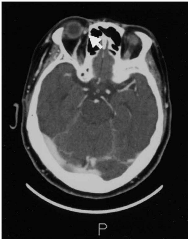
Figure 2. Enhanced computer tomograph of the head in case 8. The superior ophthalmic vein was visualized at an early contrast stage (arrow).

and glaucomatous visual field defects were more frequent in the present study than in a previous report. 9 Although it has been reported that refractory cases of secondary glaucoma due to CCF are found in eyes with neovascular glaucoma and adhesive closure of the angle, 9 there were no eyes with neovascular glaucoma and adhesive closure of the angle in the current study. Because the closure of the CCF played a key role in maintaining effective IOP control in the current study, the rate of CCF closure was considered to be responsible, at least in part, for the difference in frequency of glaucoma between the previous and the current study.